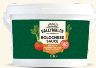
Hidden Veggies Pasta Sauce