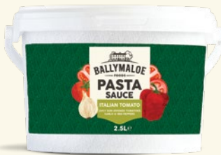
Italian Tomato Pasta Sauce