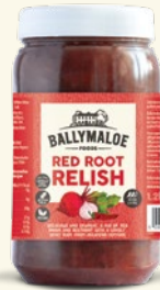
Red Root Relish