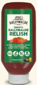
Ballymaloe Relish (Smooth)