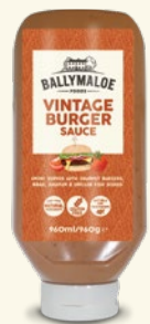
Vintage Burger Sauce