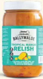
Tropical Mango Relish