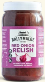
Red Onion Relish